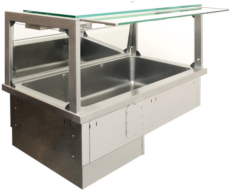
Front view: Open front pane serves as breath protection screen