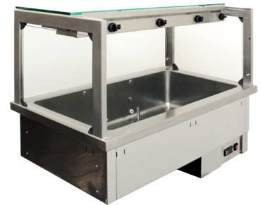
Rear view with stashed away sliding mirror