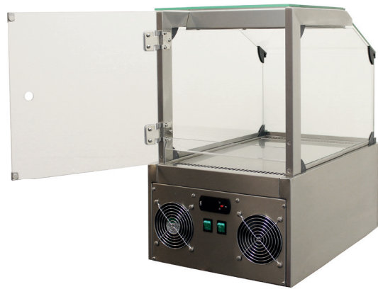
Rear view with open cabinet door and control panel