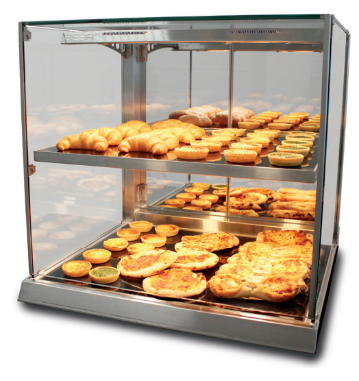
Hot Cube GN 2/1 Duplex