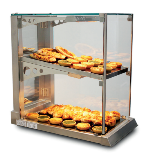
Hot Cube GN 1/1 Duplex