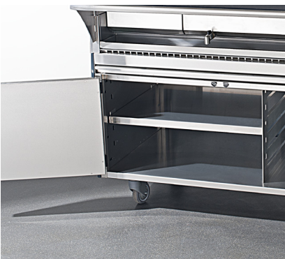
Inserting a shelf