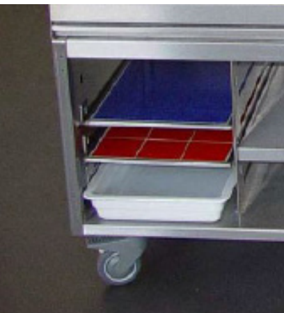
Practical guide rails for storing hotties or GN trays in GN 1/1 or GN 2/4 formats