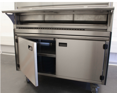
Hinged door for size GN 3/1