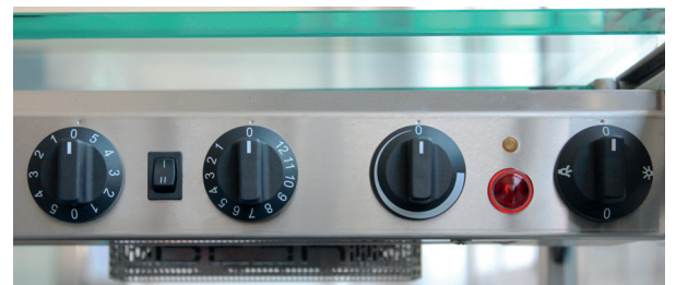
Simple manual operation using a rotary switch

Using a rotary switch, the temperatures can be set individually for each GN unit. Whether it is vegetables, meat, pasta or pizza: the easy control with its maximum and minimum heat that can be set separately lets you keep your dishes at an optimal state of freshness over a long period. With Culinario Master Duplex, you also have the possibility of presenting your dishes at two levels.